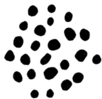
Fig. 1b. – The same in a camera lucida drawing.

I began a systematic investigation of the phenomenon of the phenotypical female intersexuality in the argellus variety of the Lycæides idas L.