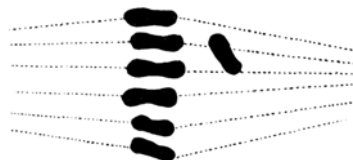
Fig. 3. – Gonial spindle in side view with a chromosome proceeding undivided towards one pole.

The plates in side view showed some abnormalities in three cases. Twice one chromosome proceeded undivided towards one pole (Fig. 3). Less clearly the same phenomenon was observed in a I-meiotic division.